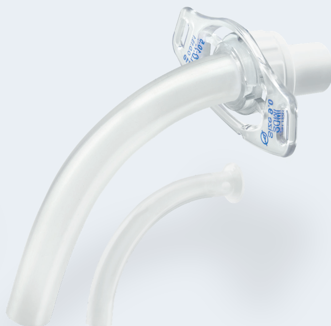
Tracheostomy tube KAN XL/XXL with inner cannula, non-fenestrated