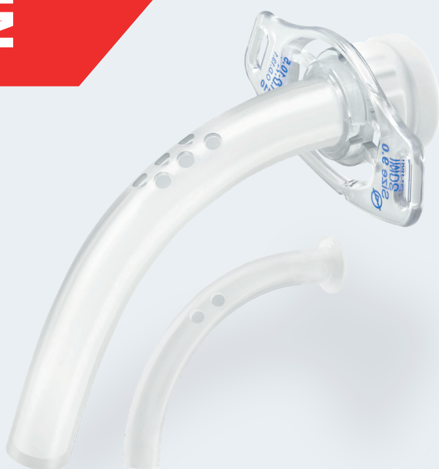
Tracheostomy tube KAN XL/XXL with inner cannula, fenestrated